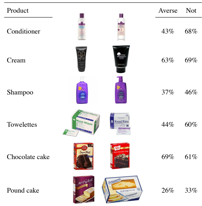
Figure 3. Pictures of the target trials, in which one of the products contained the word “moist” (left) and the other did not (right). The first four rows show hygiene products; the final two show food products. The percentage of moist-averse and non-averse participants who chose the product that contained the word “moist” on the packaging is shown in the two rightmost columns.

products), moist-averse participants were consistently less likely to choose the item with “moist” on the packaging.